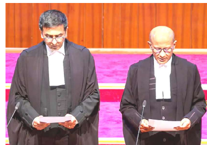
(Right) PV Sanjay Kumar, Chief Justice of Manipur High Court

Their names were recommended for elevation as apex court judges by the Supreme Court Collegium on December 13, 2022.