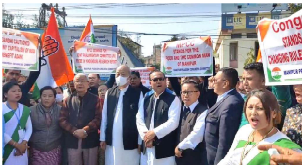
IT News Imphal, Feb 6:

'We will continue this protest across the nation until the investment to Adani issue is probed by either a Joint Parliamentary Committee or a Supreme Court-monitored committee' – O. Ibobi